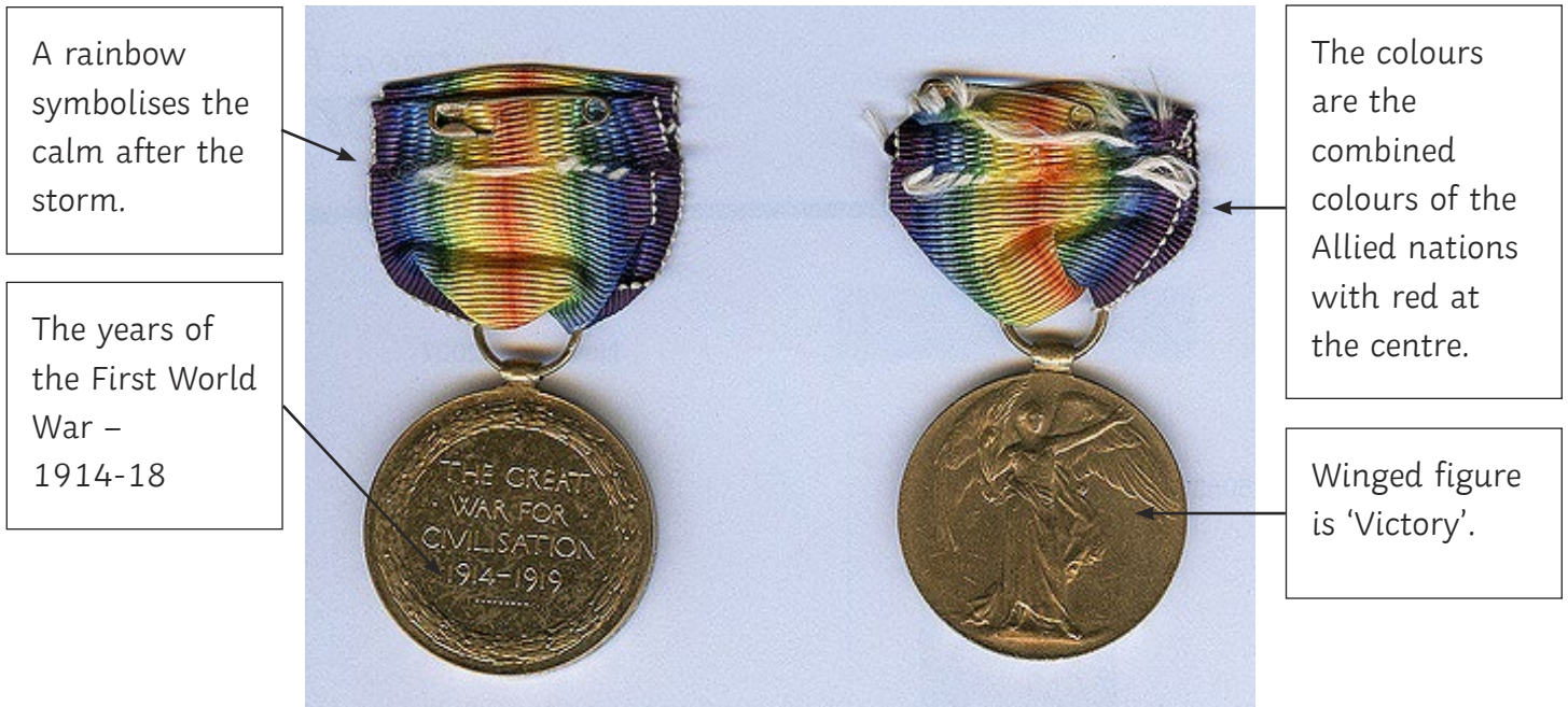
Bronze medal, not too expensive after the war, but long lasting.

This medal celebrated the end of the First World War and was given to soldiers who had fought in active theatres of the war. It was a symbol of great pride but its design was also highly symbolic .